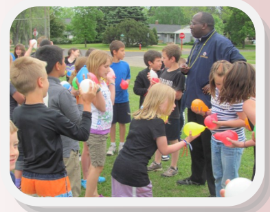
Totus Tuus 2011