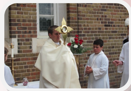
Corpus Christi procession